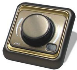
SIMON 75 SERIES